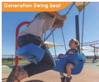
Generation Swings $3,000.00 2 available