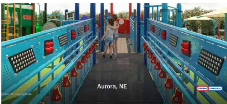
Inclusive sensory safety railings $15,000.00 each set 2 sets are available for sponsorship