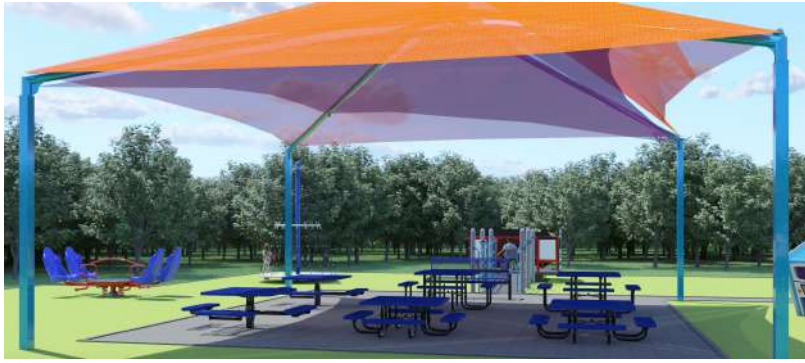
Picnic Tables and Canopies $18,000.00