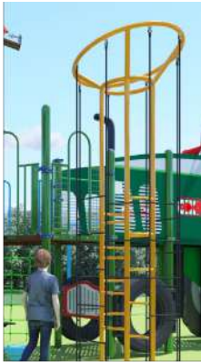
Silo Climber $6,000.00