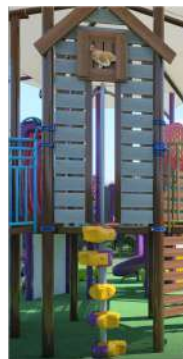
Chicken Coop w/climber $6,300.00