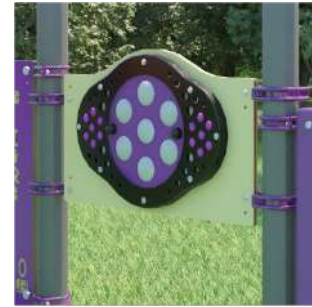
Disco Ball Panel $2,000.00