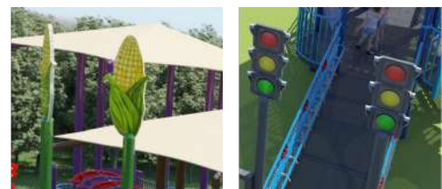
Corn or Stop Light Post Toppers $2,200.00 each set