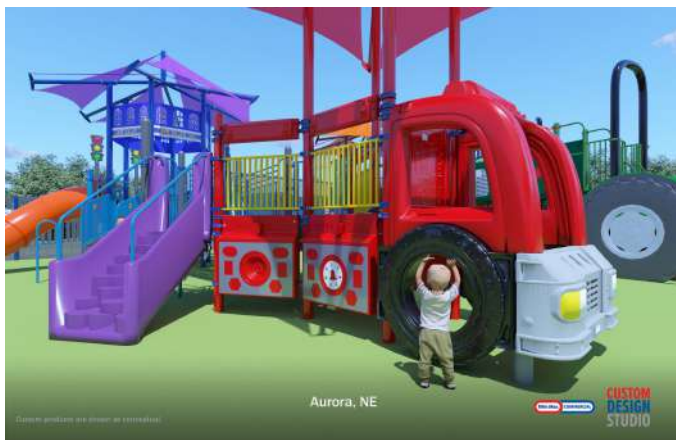
Big Red Fire Truck Imagination in full throttle! $30,000.00