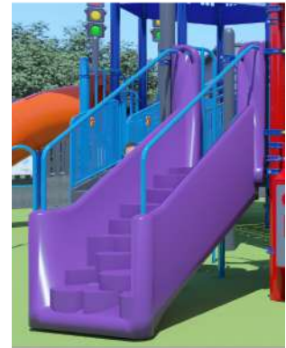
Stair Climber $4,500.00