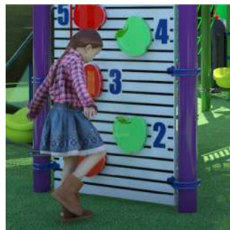
School Apple Climber $6,000.00