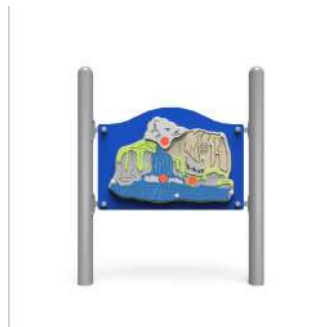
Living Art Electronic Sounds Panel $2,800.00