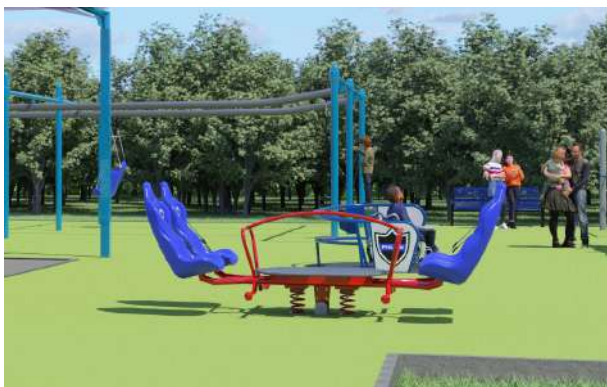
Rock Me Totter $11,500.00