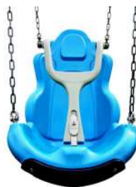
Inclusive Swing $1,800.00