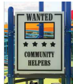
Community Panel $1,800.00