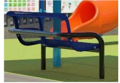
Benches $800.00 each 6 available