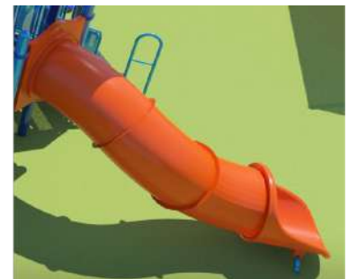
Tunnel Slide $3,000.00