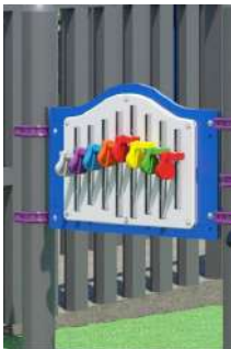
Scramble Scales x2 $2,500.00 each