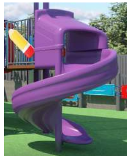
Spiral Slide $7,000.00