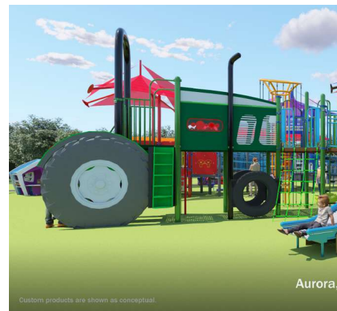
Custom Tractor Let's get planting! $30,000.00