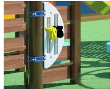
Post Players $800.00