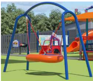
Team Swing $10,000.00