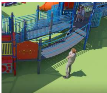
Swinging Bridge $3,800.00