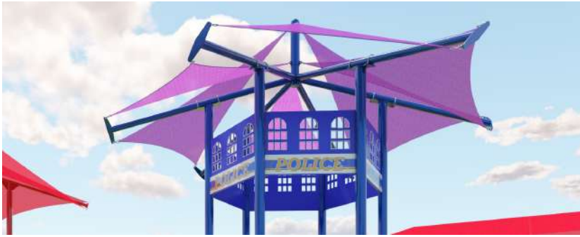
Police Station and Canopy $24,000.00