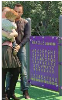
Braille Panel $2,500.00