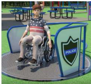
Surface Spinner $17,000.00