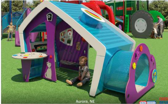
Tots Builder Playhouse $18,000.00 Let your imagination play!