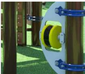
Post Players $800.00