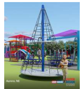
Zoomtwist with deck $15,000.00