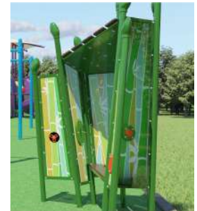
Quiet Grove $12,000.00