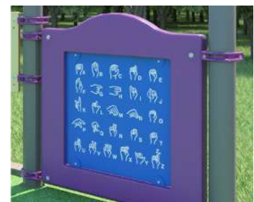
Sign Language Panel $3,000.00