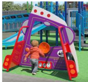
Tots Builder Truck $6,000.00