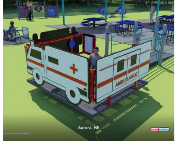
70 sq. ft. Inclusive Glider $32,000.00