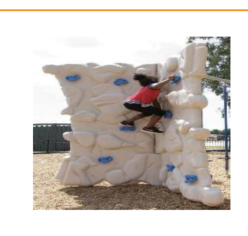
Versa Climb $12,000