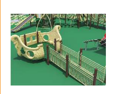
Rock'N Raft $20,000

It's about spreading smiles... Inclusion is that simple. It's about allowing everyone to share in the joy of play.