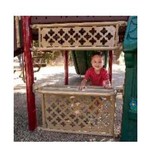
Ticket Window Area $7,000