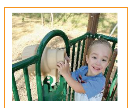
Telescope Panel $3,500