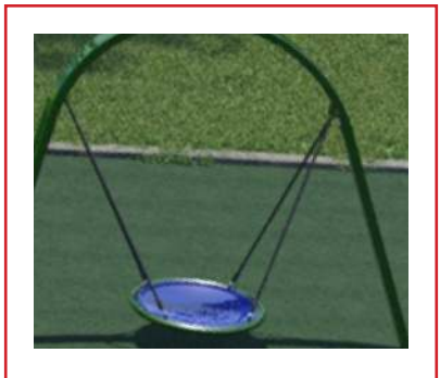
Dish Swing $15,000