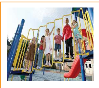
Side Step Climber $6,000