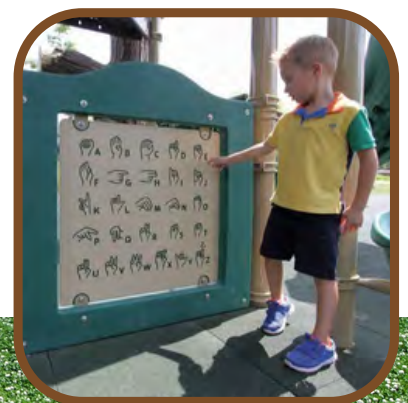
Sign Language Board