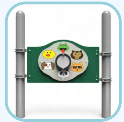
Silly Face Reach Panel