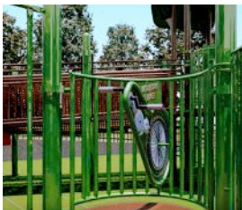
Mountain Bike $5,000 (2 available)