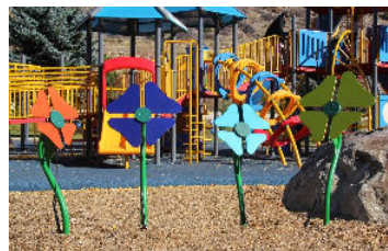
Musical Flowers $4,000 each