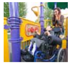
Panel Gear $5,000