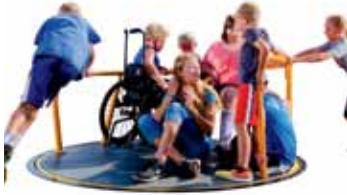
Surface Spinner $25,000