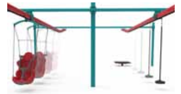
UP Rail Rider $40,000

Your generous support will enable ALL children and caregivers of all abilities the opportunity to experience the joys and benefits of play. This destination playground will truly impact ten thousand people each year.