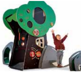
Tot Builders Silly Tree $20,000