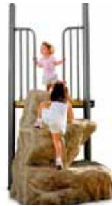
Big Fun Rock $10,000