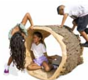
Crawl Log $8,000