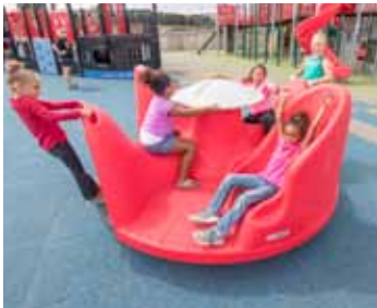
Revolution Spinner $10,000