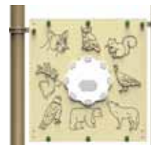
Sounds Animal Panel $5,000