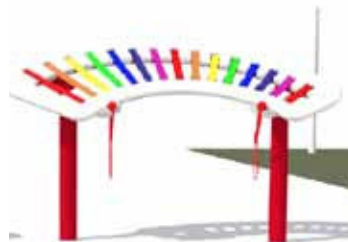
Concerto Vibes $6,000