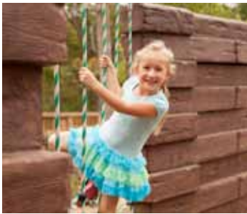
NUedge Double $20,000