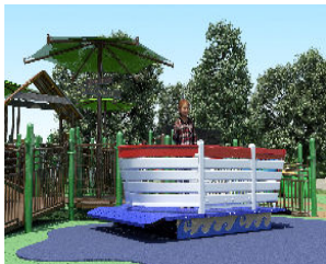
Fisherman's Boat Glider $30,000