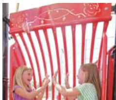
Monkey Lean $6,000