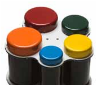
Five Congos $6,000