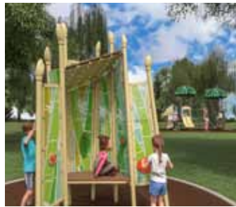
Quiet Grove $15,000