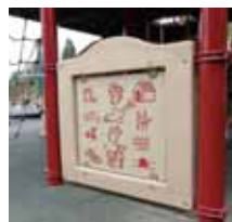
Animal Panel $5,000