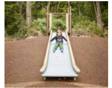
Roller Slide $15,000