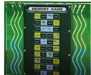
Memory Panel $2,500