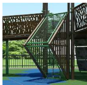
Diamond Climber $7,500