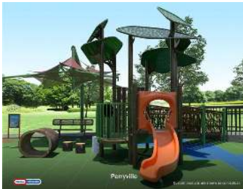
2-5 Section $35,000