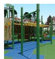
Overhead Climbers $9,000