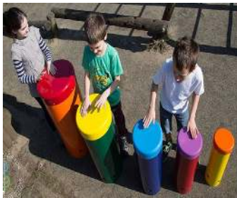
Tuned Drums $3,000