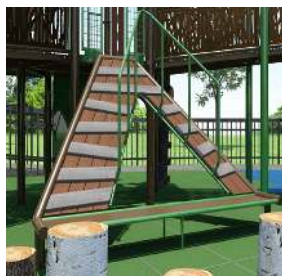
Plank Climber $8,000