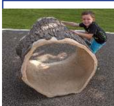
Log Tunnel $5,000