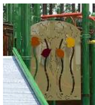
Leaf Panel $3,500