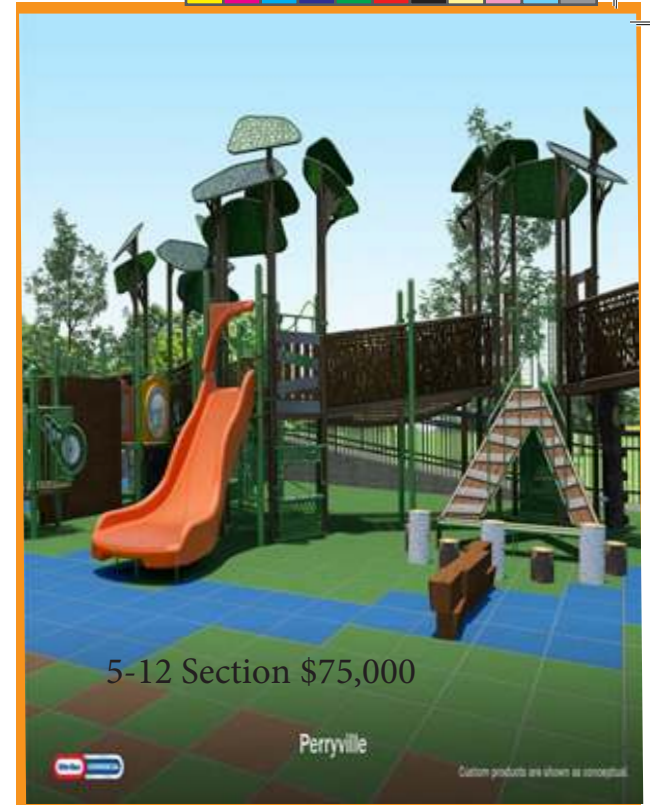
5-12 Section $75,000