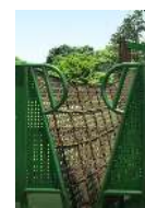
Vine Climber $7,500