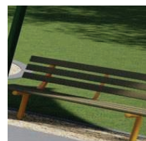
Benches (5) $1,500 Each