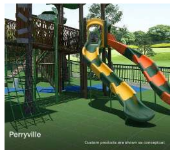
Slide 2-5 Section $15,000