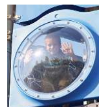
Bubble Lookout $2,500