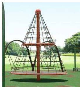
Rotating Dish $25,000