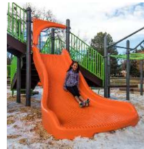
Slalom Slide $12,000

It's about spreading smiles...Inclusion is that simple. It's about allowing everyone to share in the joy of play.