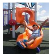
Elbow Slide $8,000