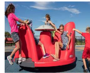
Rev Spinner $15,000