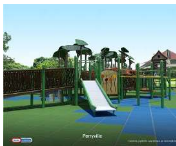
Roller Slide $15,000