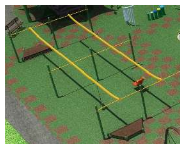
Zip Line $30,000