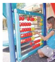
Abacus Panel $3,000