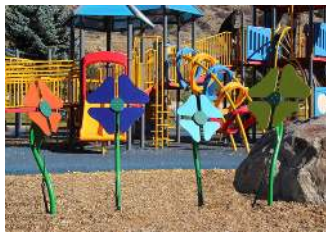
Flower Gongs $6,000