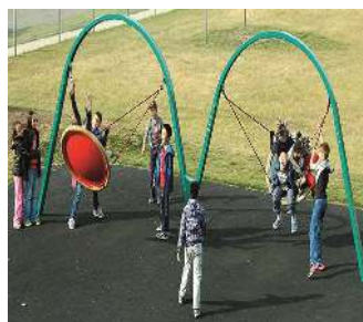
Double Dish Swing $45,000