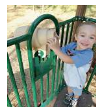
Telescope Panel $2,500