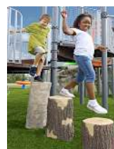
Stump Climbers $3,000