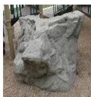
Tri Rock Challenge $12,000