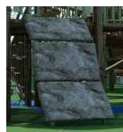
Rock Challenge Wall $10,000