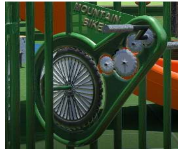
Mountain Bike Gear panel $5,000