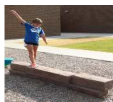
Balance Beam $2,500