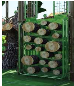
Lumber Jack Climber $10,000