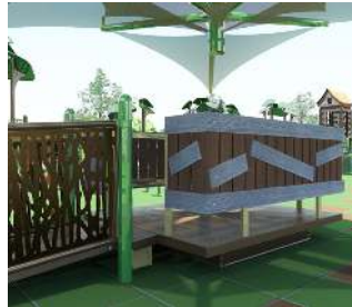
Inclusive Treehouse Rocker $30,000