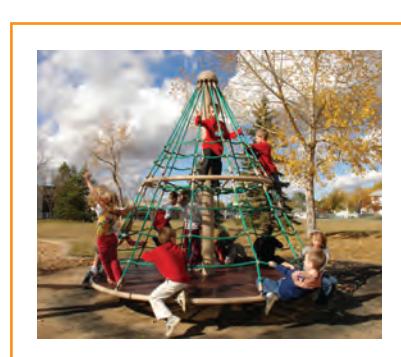
Rotating Net w/Deck $15,000