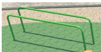
Parallel Bars $3,000