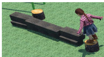
Balance Beam $5,000