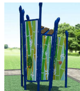
Quiet Grove $12,000