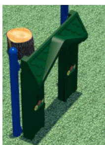
Standing Panel $4,000