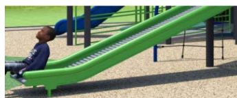
Roller Slide $12,000