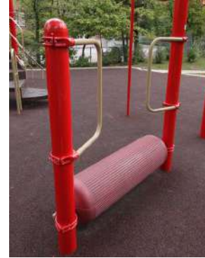
Log Roll $3,300.00