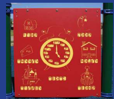
Braille Play Panel $1,800.00

TOGETHER WE CAN CREATE YOUR DESTINATION PLAYGROUND WHERE WE ALL CAN PLAY!