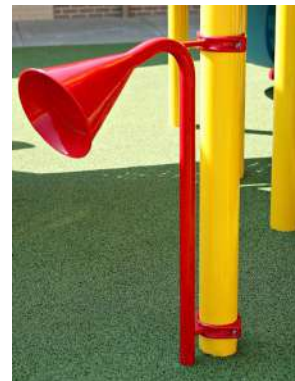
Talk Tube $1,700.00