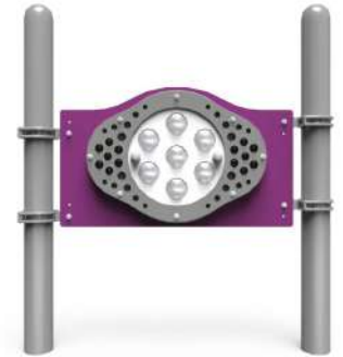
Disco Party Panel $3,500.00