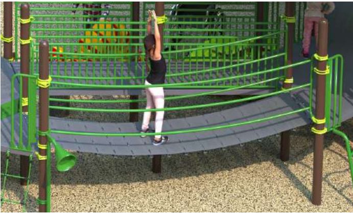
Clatter Bridge $8,300.00