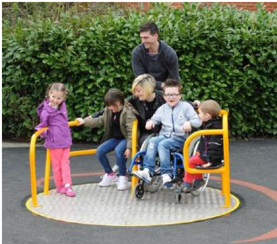
Surface Spinner Merry-Go-Round $21,000.00