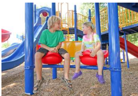
Hang out seats $2,500.00