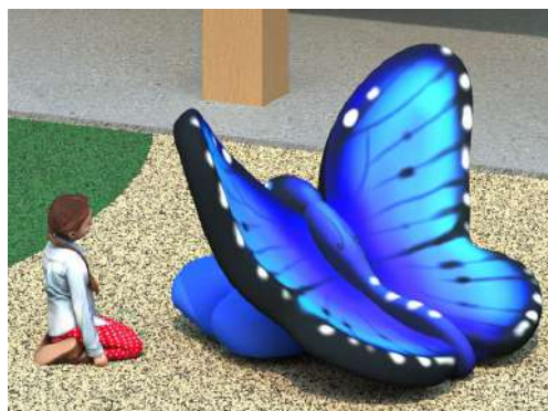
Blue Butterfly Climber $10,500.00