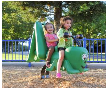
Grasshopper Spring Rider $3,000.00