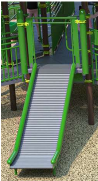
Roller slide $14,000.00