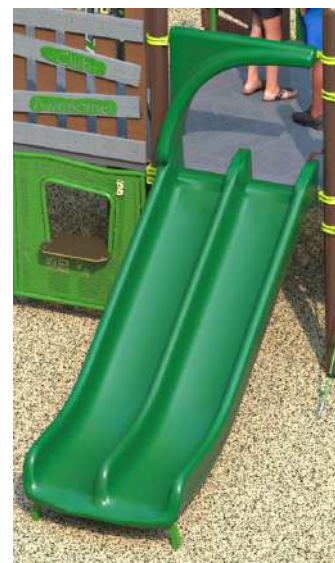
Double Slide $4,000.00