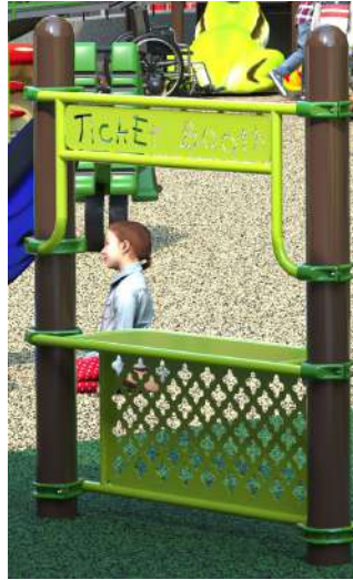
Ticket Booth Panel $3,000.00