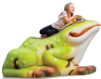
Sculpted Frog Climber $15,000.00