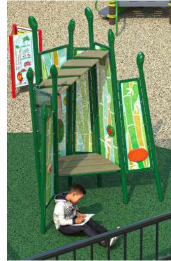
Quiet Grove $14,000.00