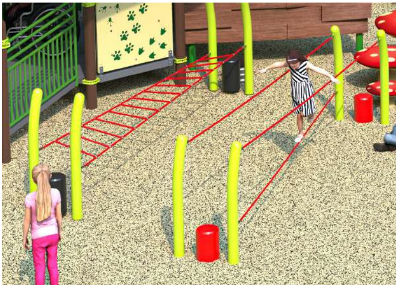
Grand Canyon Rope Course $20,500.00