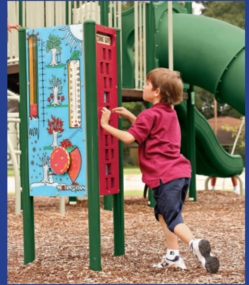
The Weather Station $4,800.00