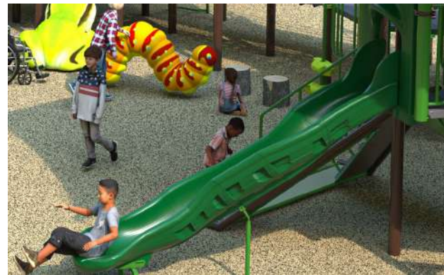
Quantum Slide ~ Two available $6,500.00 each