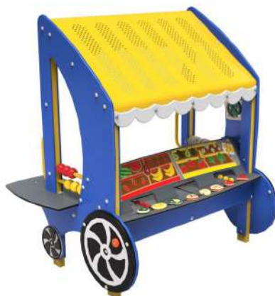
Market Stand $14,500.00