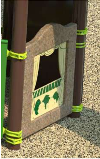
Theater Panel $3,000.00