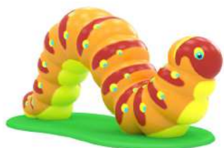
Inchworm Climber Panel $7,800.00