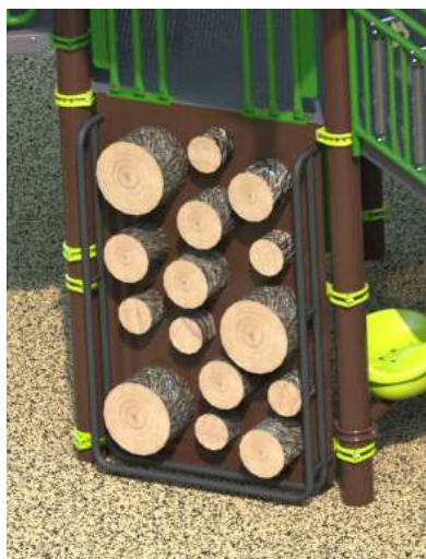
Split Log Climber $5,500.00