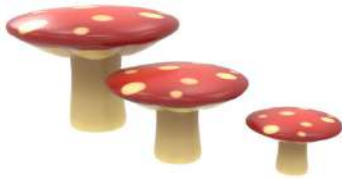
Mushroom Climbers $12,000.00