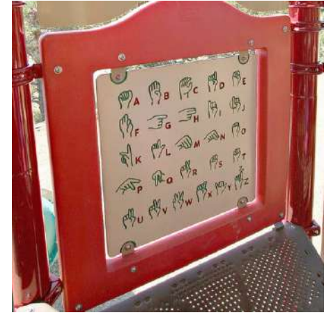
Sign Language Panel $2,500.00