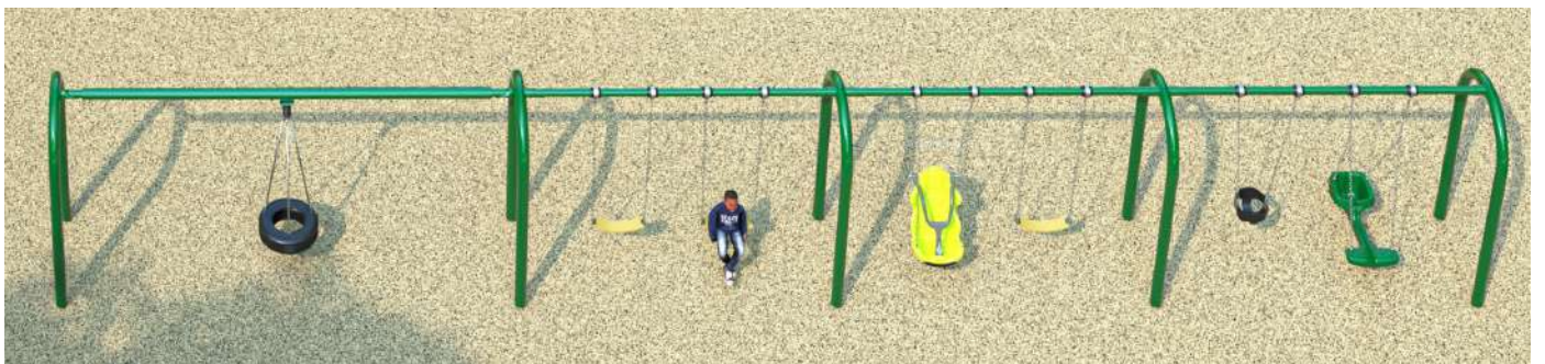
Swing Set Includes a Generation Swing, Tire Swing and Inclusive Swing $18,000.00