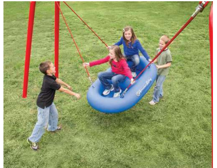
Raft Swing $13,000.00