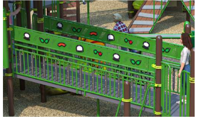
Sensory Safety Rails $12,000.00 each set ~ 3 sets available