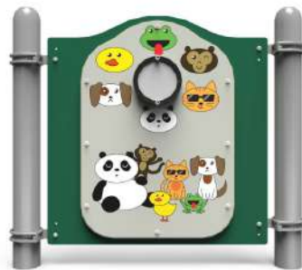
Silly Face Panel $3,000.00