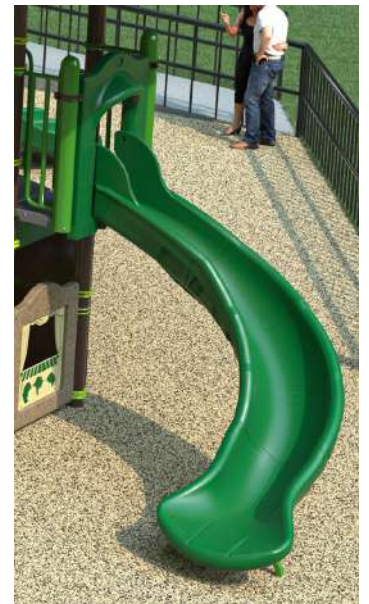
Green Curved Slide $7,000.00