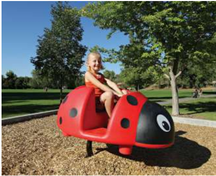
Lady Bug Spring Rider $2,800.00