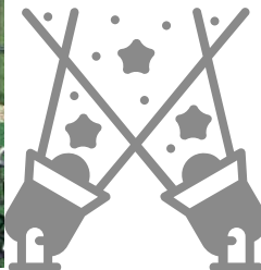
Theater Play Station $23,000.00