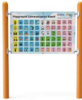
Communication Sign $2,400.00