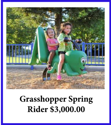
Grasshopper Spring Rider $3,000.00