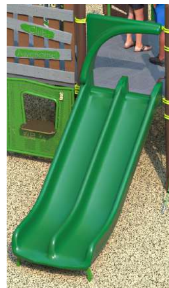
Double Slide $4,000.00