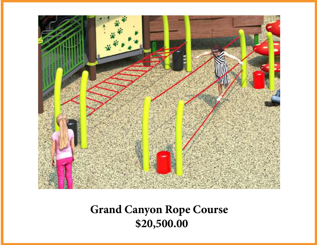
Grand Canyon Rope Course $20,500.00