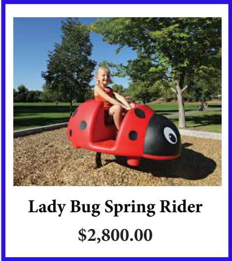
Lady Bug Spring Rider $2,800.00

“PLAYGROUNDS MAKE ME FEEL POWERFUL.” Brendan, Age 10