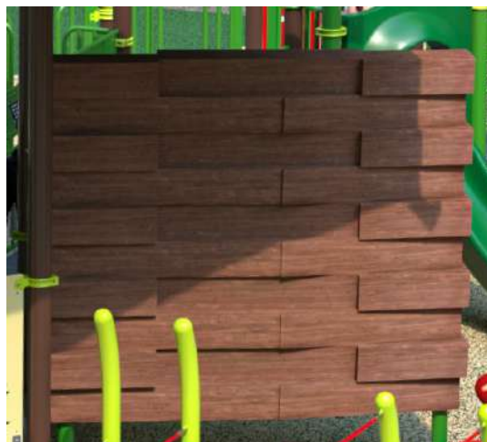
Stacked Timber Climb $14,000.00