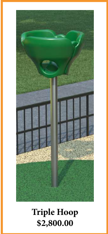
Triple Hoop $2,800.00