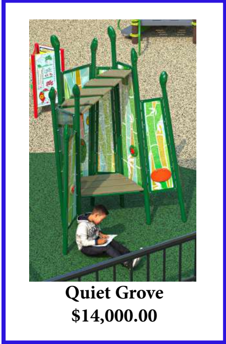
Quiet Grove $14,000.00