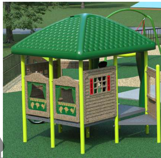
Theater Play Station $23,000.00