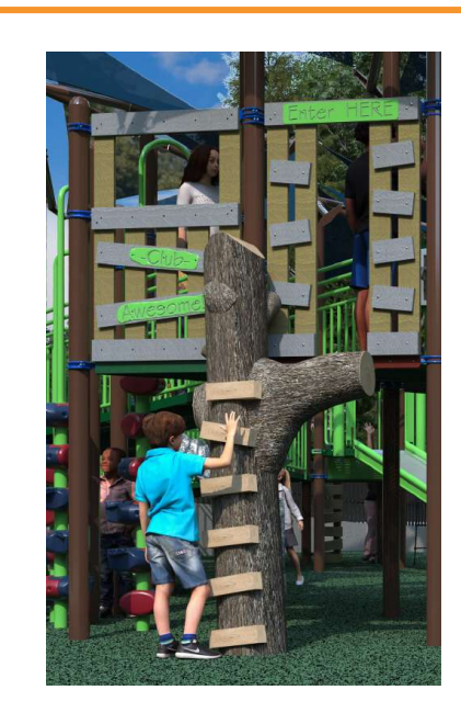
Club House Tree Climber $13,000.00