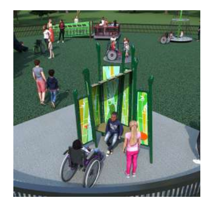
Quiet Grove $15,000.00

"Your generous support will create a destination playground where children and caregivers of ALL abilities can share in the joys and benefits of play. This inclusive space will make a lasting impact on every visitor, fostering connection, creativity, and community for all."