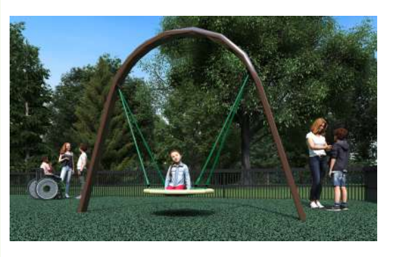
Dish Swing $17,500.00