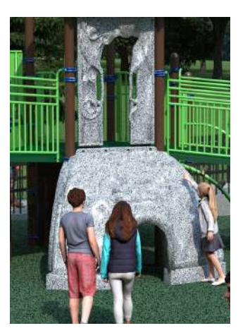
Tikes Peak $17,000.00