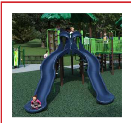
Double Slide $9,000.00