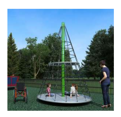
Zoom Twist $25,000.00