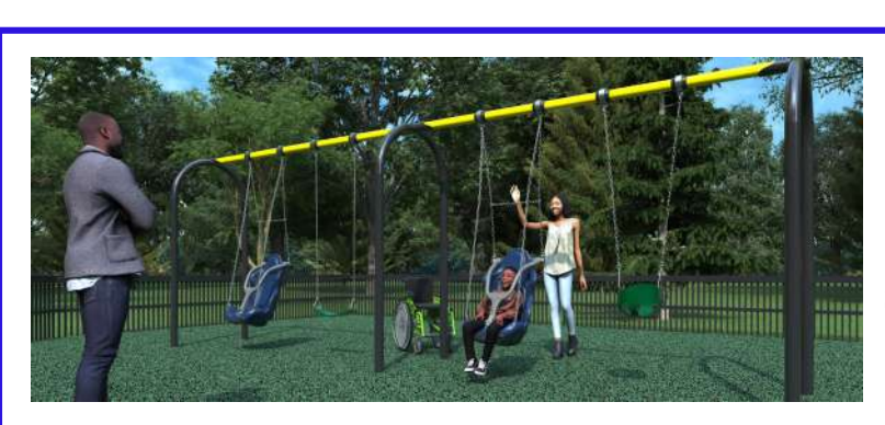
Swing Set with two inclusive seats