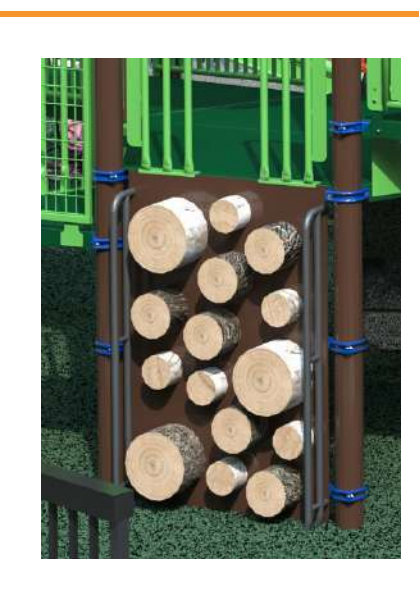
Stump Climbers $6,000.00