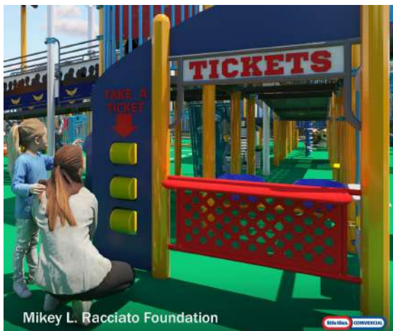
Ticket Booth $6,500.00