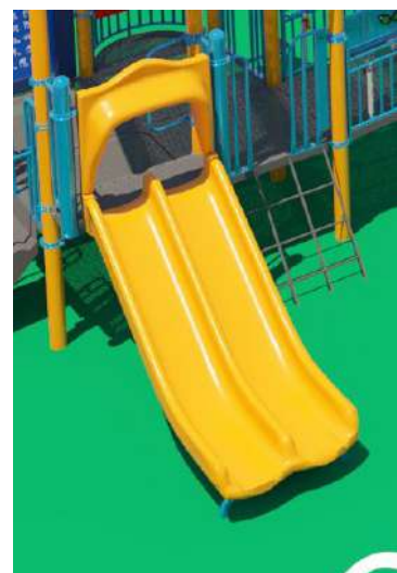
Double Slide $5,000.00