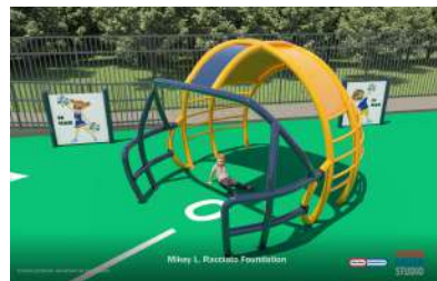
Custom Football Helmet Climber $30,000.00