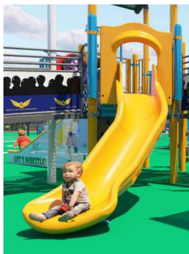
Yellow curved slide $3,000.00