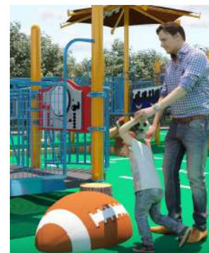
Custom Football Stepper $5,600.00