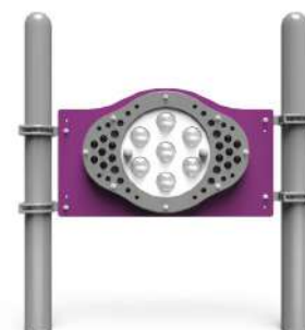
Disco Party Panel $3,000.00