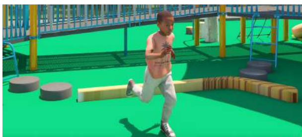
Custom Hockey Stick & Pucks Balance Beam $11,000.00