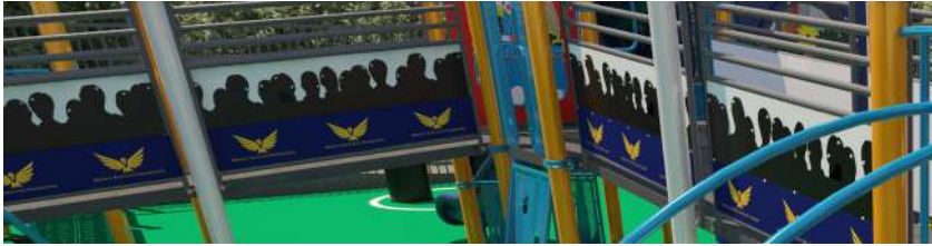
Custom Fans in the Stands Panels $3,500.00 each section ~ 10 available

This destination playground will truly impact our community far beyond the playground.