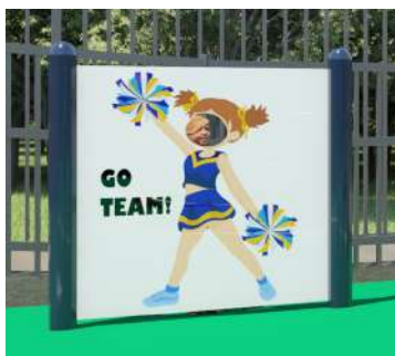
Cheerleader Panel $5,500.00