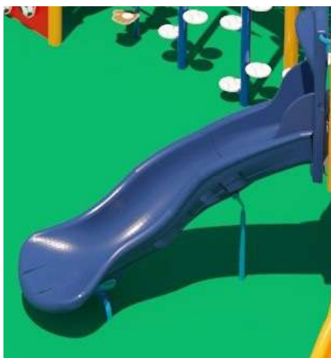
Blue Curved Slide $3,000.00