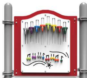
Scramble Scales Panel $4,500.00