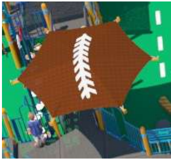
Football Shade $11,500.00