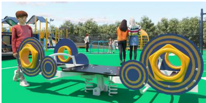
Team Totter $11,000.00