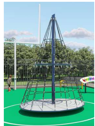
Zoom Twist with Deck $20,000.00