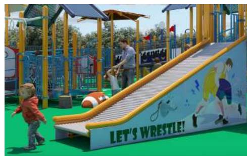
Roller Slide with Custom Wrestling Panel $18,000.00