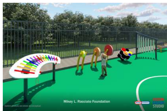
Music Areas $12,000.00 each Two Sets available