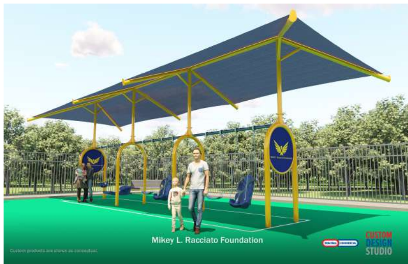
Custom Swing Set with Shade $28,000.00