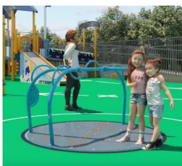
In Ground Merry Go Round $12,000.00