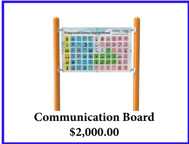
Communication Board $2,000.00