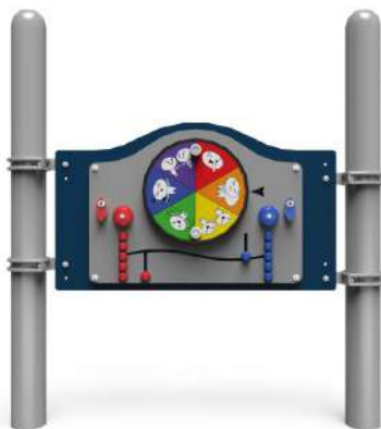
Simon Say Panel $3,500.00