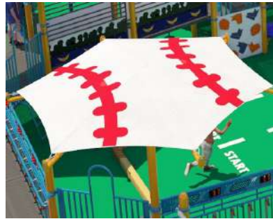
Baseball Shade $11,500.00