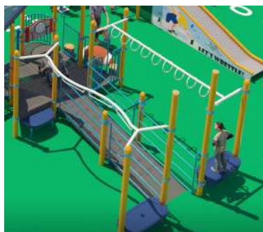
Double monkey bars $5,500.00