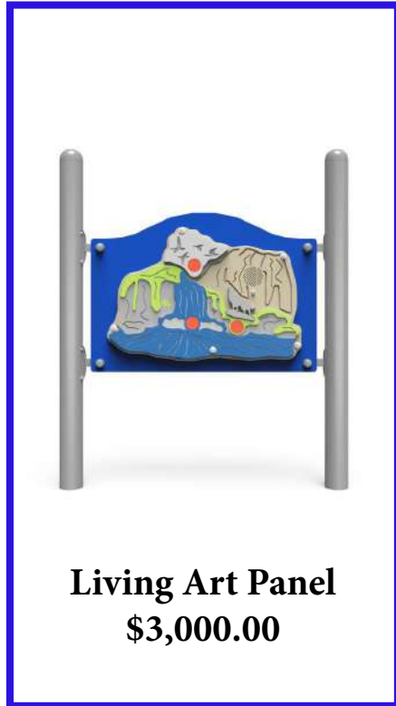
Living Art Panel $3,000.00