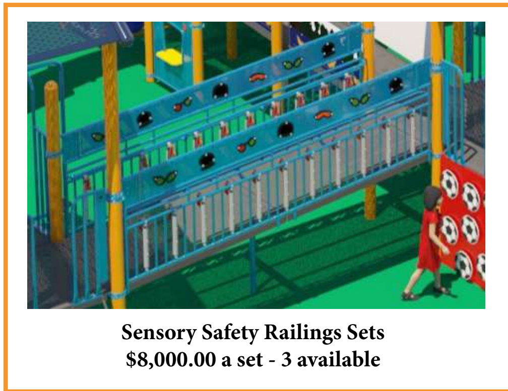
Sensory Safety Railings Sets $8,000.00 a set - 3 available