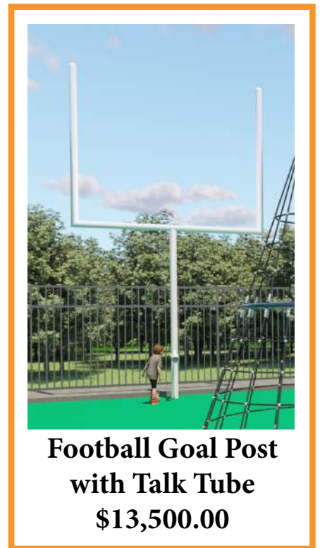
Football Goal Post with Talk Tube $13,500.00