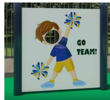
Cheerleader Panel $5,500.00