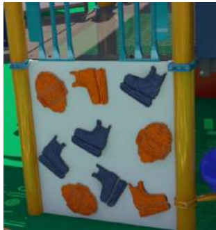
Hockey Climbing Panel $4,800.00