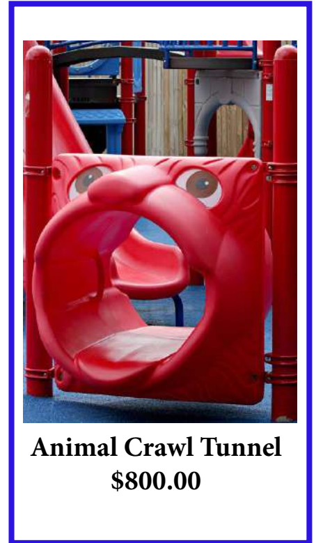
Animal Crawl Tunnel $800.00