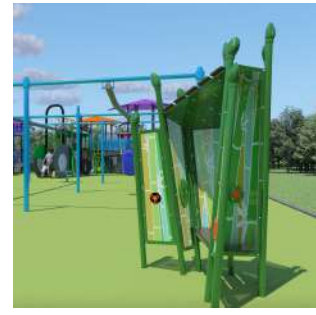
Quiet Grove $14,000.00