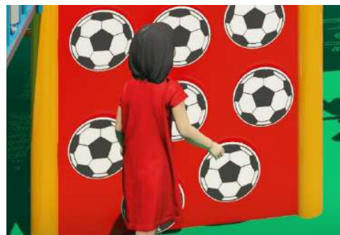
Soccerball Climbing Panel $4,500.00