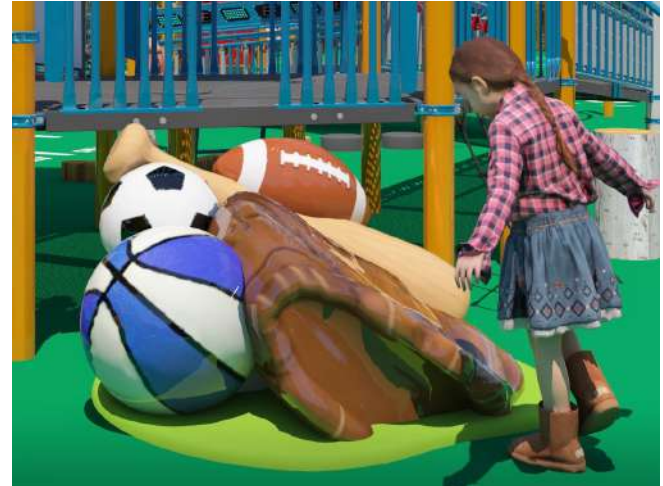
Custom Sports Gear Sculpture $18,000.00