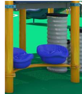
Conversation Seats $600.00