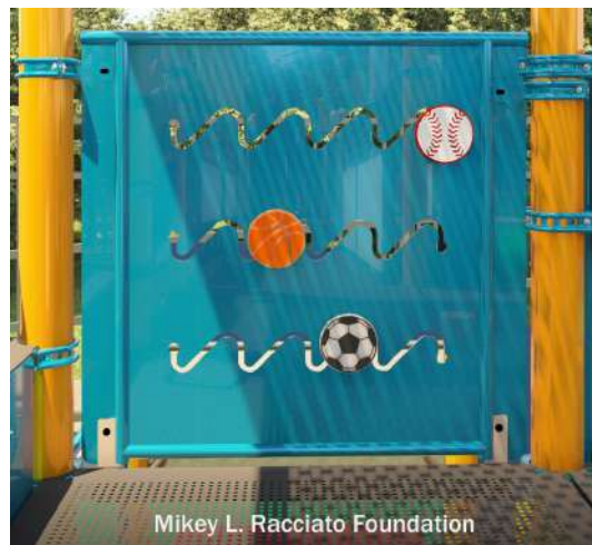
Sports Balls Play Panel $3,500.00