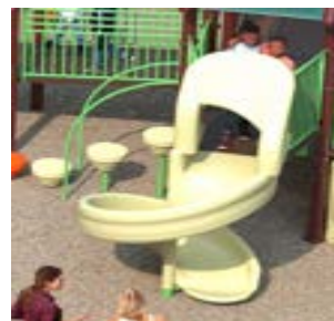
Spiral Slide $7,000