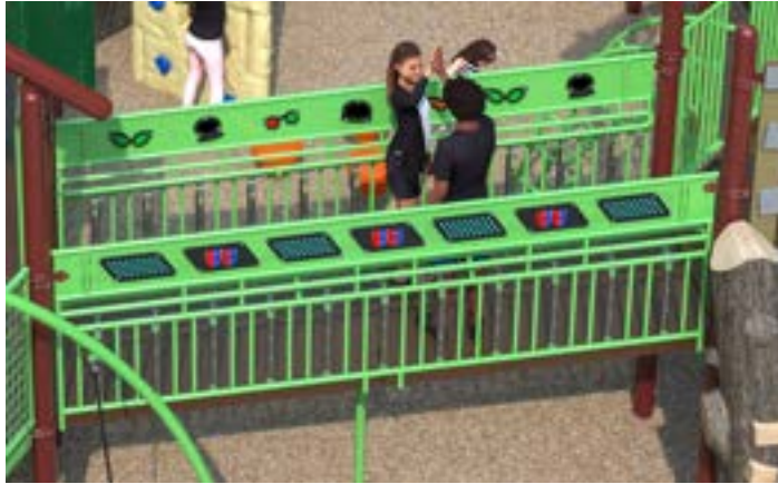
Sensory Safety Rails - two sets each set - $10,000