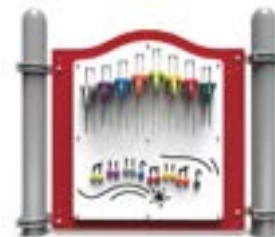
Scramble Scales Panel $5,000