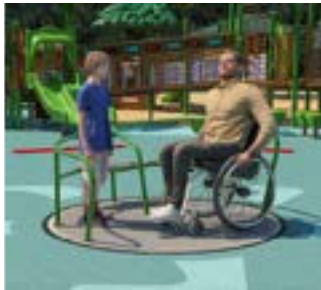
Surface Spinner $15,000