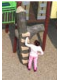
Tree Climber $6,000