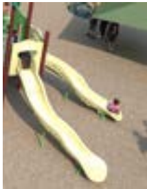
Double Slide $15,000