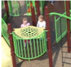
Disco Ball Party Panel $5,000