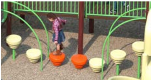
7 Stone Climbers $7,000