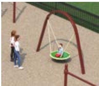
Dish Swing $18,000