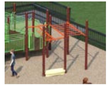
Double Monkey Bars $3,500

Your generous support will enable ALL children and caregivers of all abilities the opportunity to experience the joys and benefits of play. This destination playground will truly impact 10,000 people each year.