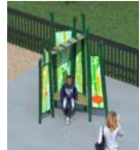
Quiet Grove $12,000