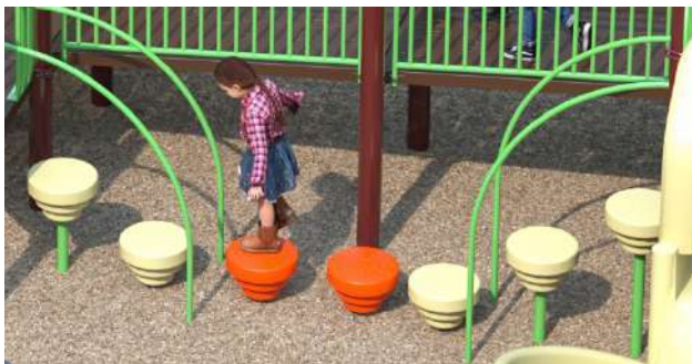
7 Stone Climbers $7,000