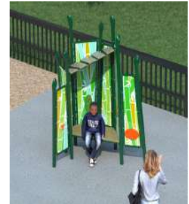
Quiet Grove $12,000