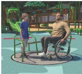
Surface Spinner $15,000