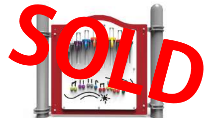
Scramble Scales Panel $5,000