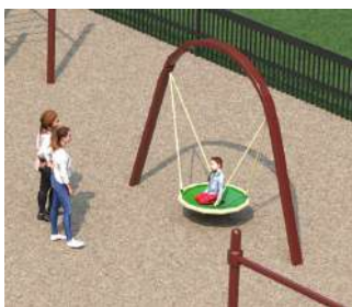
Dish Swing $18,000