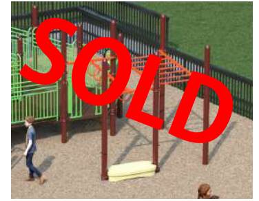
Double Monkey Bars $3,500

Your generous support will enable ALL children and caregivers of all abilities the opportunity to experience the joys and benefits of play. This destination playground will truly impact 10,000 people each year.