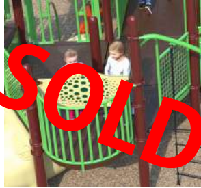
Disco Ball Party Panel $5,000