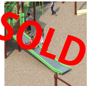
Roller Slide $12,000