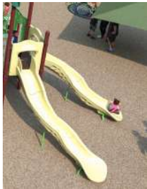
Double Slide $15,000