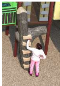
Tree Climber $6,000