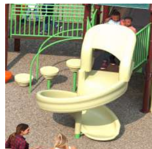
Spiral Slide $7,000