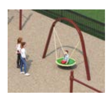
Dish Swing $18,000