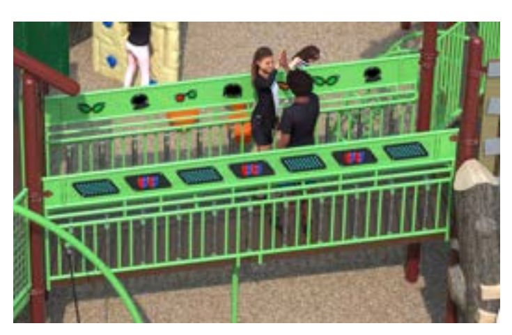
Sensory Safety Rails - two sets each set - $10,000