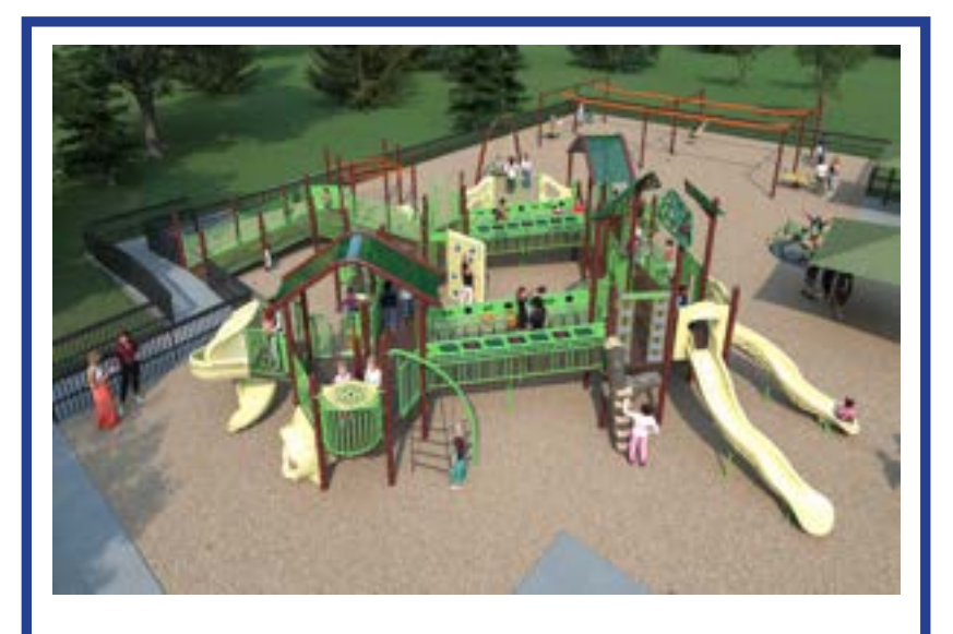
Inclusive playgrounds are for everyone! Come join us.