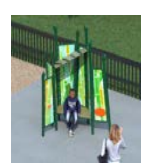
Quiet Grove $12,000