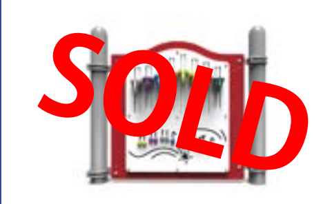
Scramble Scales Panel $5,000