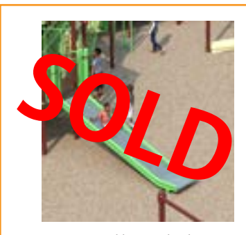
Roller Slide $12,000