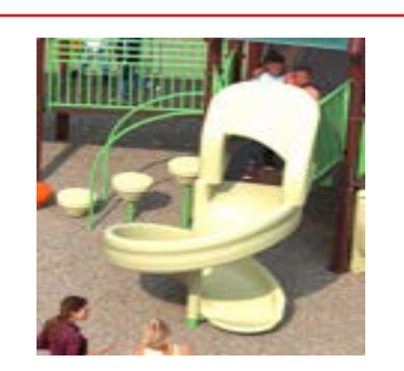
Spiral Slide $7,000