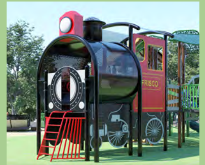
Frisco Train $45,000