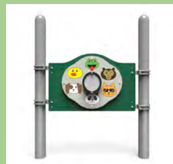
Silly Faces Reach Panel $5,000