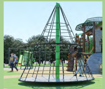
Zoom Twist $15,000