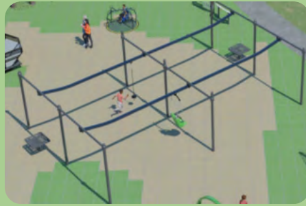
40 Yard Zip Line $30,000