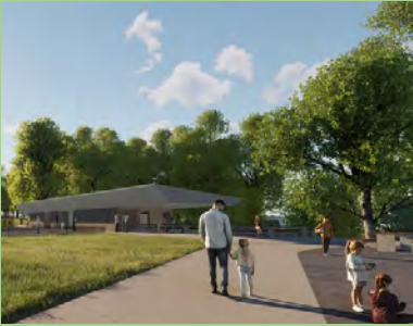
Pavilion with Concessions & Restrooms $1,180,003