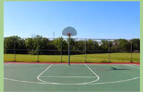
Half – Court Basketball $54,728