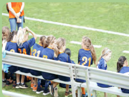
Player Seating $36,000