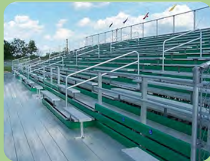
Bleachers (2) $30,000