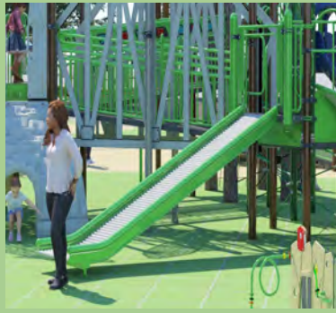
Roller Slide $15,000