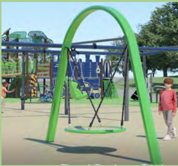
Disc Swing $10,000