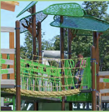
Rope Bridge $8,000

Join us in our efforts to build this universally accessible park. Your generous support will enable all members of our community, regardless of their abilities, to experience the joys and benefits of play. This park will impact 10,000+ people each year!