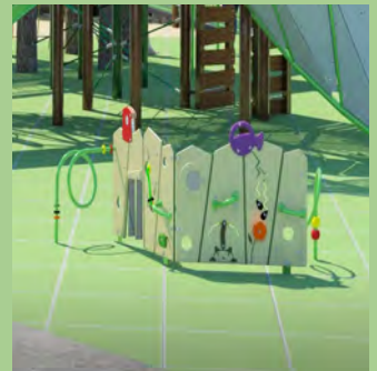
Sensory Panel $5,000