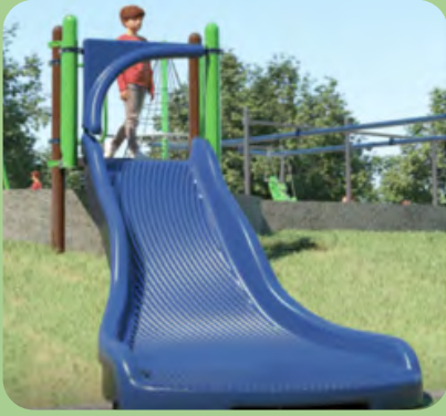
Hill Slide $12,000