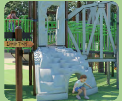
Tikes Peak $12,000