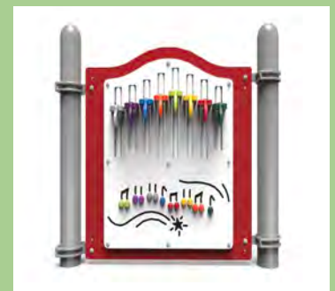
Scrabble Scales Panel $5,000