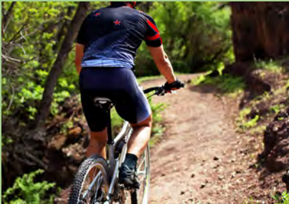
Bike Path $200,000