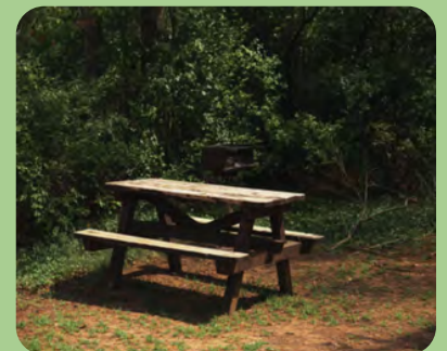
Picnic Tables (11) $5,000