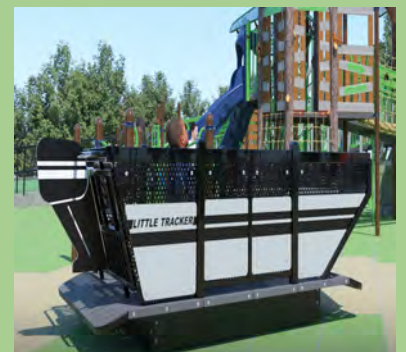
Inclusive Rocker $30,000