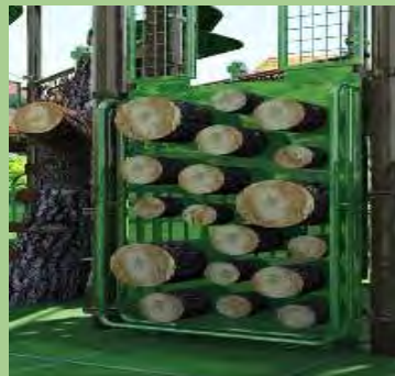
Lumber Jack Climber $5,000