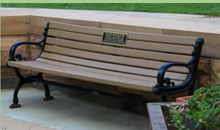
Dedication Park Benches with Personalized Dedication Plaque $5,000 each