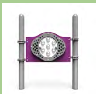
Disco Party Panel $5,000