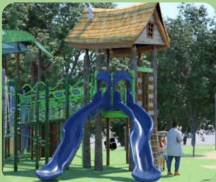
Double Quantum Slide $18,000