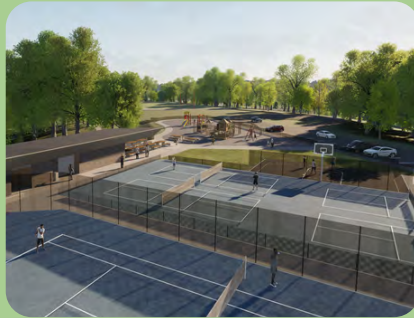
Pickleball Courts $218,912