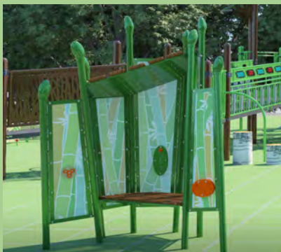
Quiet Grove $15,000