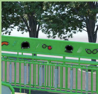
Playful Railing $5,000