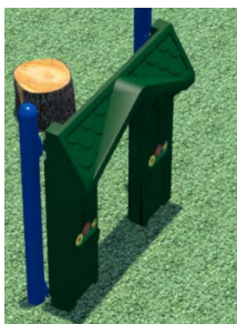
Standing Panel $4000