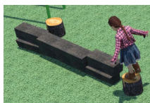
Balance Beam $5000