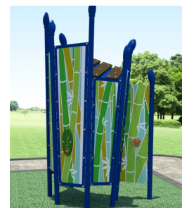
Quiet Grove $12,000