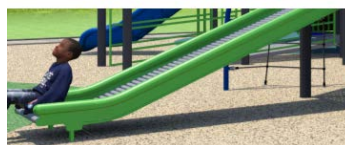
Roller Slide $12,000