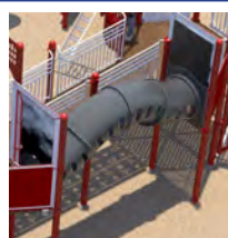
Crawl Tunnel $10,000