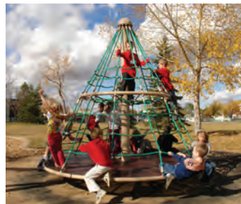
Rotating Net w/Deck $15,000