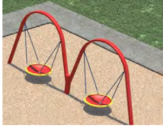
Double Dish Swing $25,000