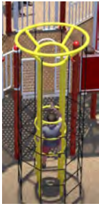
Silo Rope Climber $7,500