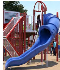
Morphis Slide $15,000