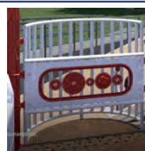
Gear Panel $3,500