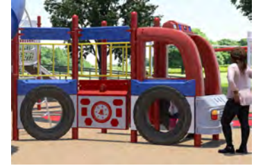
Fire Truck $45,000

Your generous support will enable ALL children and caregivers of all abilities the opportunity to experience the joys and benefits of play. This destination playground will truly impact ten thousand people each year.