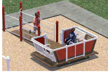
Together Glider $30,000