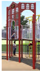
Fire House $20,000