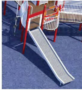
Roller Slide $15,000