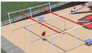
Zip Line $30,000