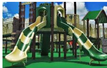
Double Quantum Slide $12,000