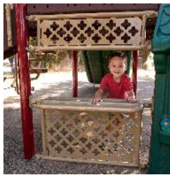
Ticket Window Area $7,000