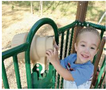
Telescope Panel $3,500