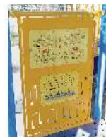
Melody Maker $4,500