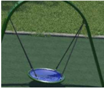
Dish Swing $15,000