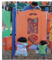
Seven Station Play Factory $2,000