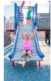
Roller Slide $10,000