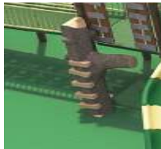
Log Climber $5,000