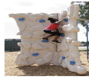
Versa Climb $12,000