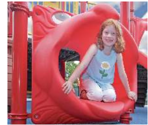
Animal Crawl Tunnel $3,500