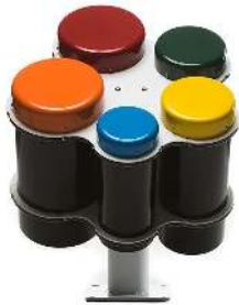
Congas Five $5,000