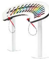
Rotating Net w/Deck $8,500