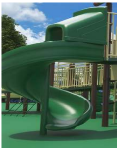
Spiral Slide $6,000