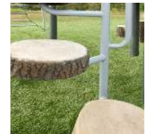
Log Slice Climber $6,000