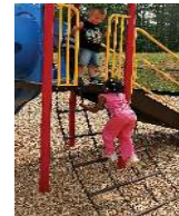
Chain Climber $3,000