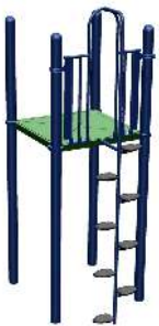
Pod Climber $4,000