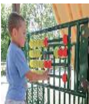
Abacus Pannel $2,500