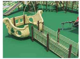
Rock'N Raft $20,000

Inclusion is that simple. It's about allowing everyone to share in the joy of play.