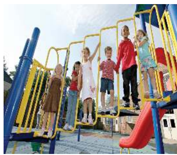
Side Step Climber $6,000